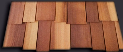
EXTREME STAGGER, OPEN KEYWAY