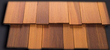
STAGGERED BUTT, OPEN KEYWAY